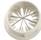
S-29B 8-Wedge Blade Cup w/cover