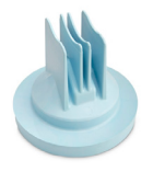
S-10 6-Slice Plunger (fits S-04B)