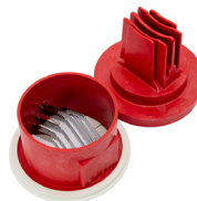
S-17K 7-Slice Tomato Set