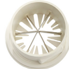
S-03B 6-Wedge Blade Cup w/cover