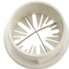
S-05B 4-Wedge Blade Cup w/cover