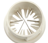
S-30B Blade Cup w/cover (3-in-1)