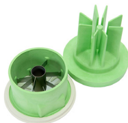
S-38K 8-Wedge Apple Corer Set