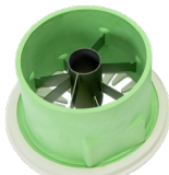
S-37B 8-Wedge Apple Corer