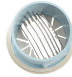
S-04B 6-Slice Blade Cup w/cover