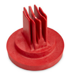
S-16 7-Slice Tomato Plunger (fits S-15B)