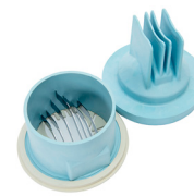
S-39K 6-Slice Blade Cup & Plunger Set