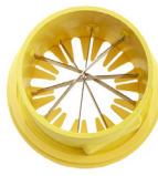
S-20B 10-Wedge Blade Cup w/cover