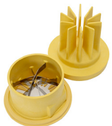
S-22K 10-Wedge Blade & Plunger Set