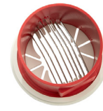
S-15B 7-Slice Tomato Blade Cup w/cover